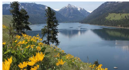
Wallowa State Park at Joseph, OR