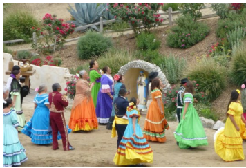
A scene from the outdoor pageant Ramona. Many from the recent WIR braved the cool, windy, light rain to see this famous production.

“Holiday Rambler has a “positive brand equity” – meaning perceived value for cost.”