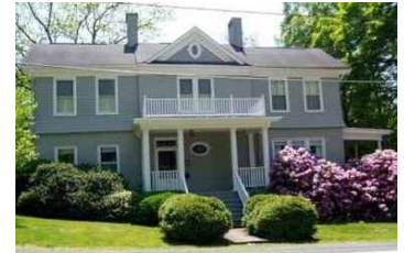
Just one of the many historic homes in Lewisburg. Note the huge hydrangeas.

If your travels bring you this way, be sure to stay at the West Virginia Fairgrounds in Fairlea, WV.