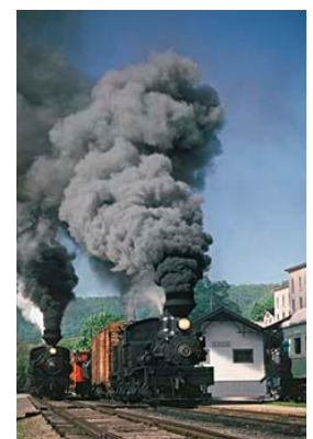
The Shay engine getting under a full load of steam.