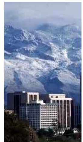
"The Old Pueblo" with a snowy backdrop.

by a light bulb. All is held by a decorative holder. There is a rich variety of scents available. Other items offered are hand sanitizers, hand creams and much more. Be sure to see, and smell, the demonstration.