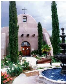
Holy Trinity Monastery St. David, AZ